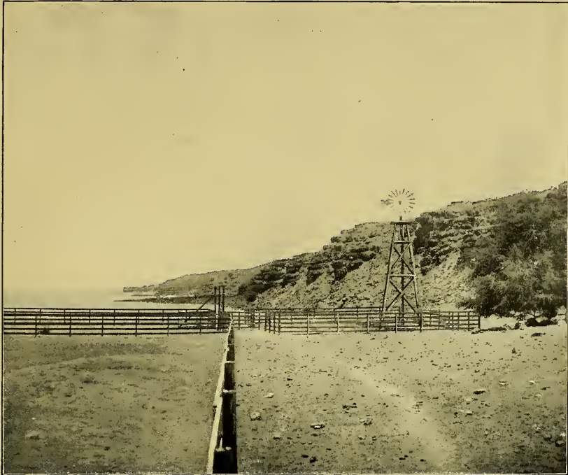
A. SOUTH COAST OF MOLOKAI AT KOLO WINDMILL, WEST END OF ISLAND, LOOKING WEST.

Showing seacliff and successive basalt flows sloping down toward the coast.